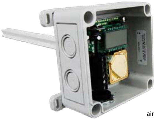
Unique X sampling probe picks up airflow regardless of direction mounted.