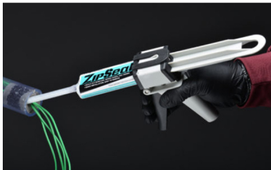
Prevents sensor damage from conduit condensation