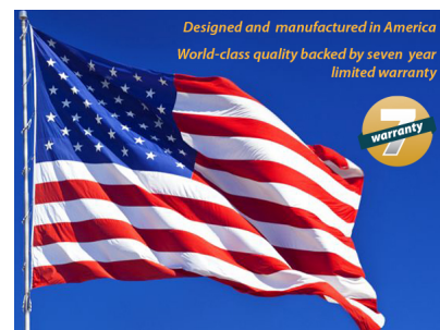
Buy American Act Certified