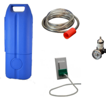
Calibration kit available