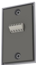
Gasket seals element from wall drafts. 45 degree terminals for ease of wiring