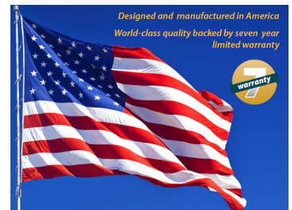
Buy American Act Certified