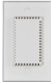
Minimalist recessed CO sensor