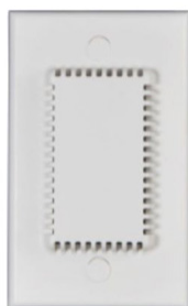
Minimalist recessed CO sensor