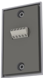
Gasket seals element from wall drafts. 45 degree terminals for ease of wiring