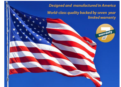
Made in the USA - 7-year Warranty