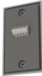
Gasket seals element from wall drafts. 45 degree terminals for ease of wiring.