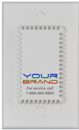
Your brand, your product. Affordable high-quality branding. Generate service calls for life.