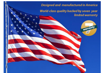
Made in the USA - 7-year Warranty