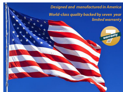
Made in USA - 7 year warranty (probe only)