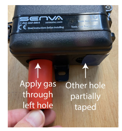
Figure 3: Applying test gas with enclosure closed.

2) To test response with the enclosure closed, partially tape one hole of enclosure and apply gas through the other hole. This will ensure the concentrated gas build within the enclosure and ambient air can escape without building pressure.