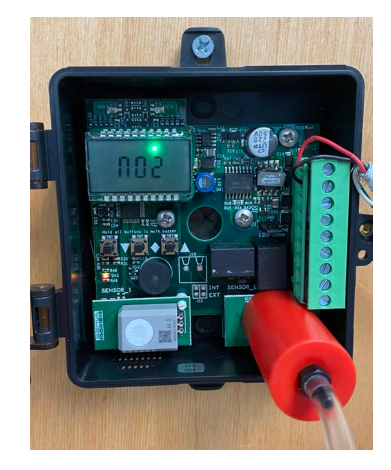
Figure 2: Recommended calibration check setup

1) For the fastest and most efficient gas usage, apply gas directly to sensor as shown in Figure 2. After 60 seconds, the device should read about 90% of the expected concentration. For 100%, continue applying gas for a total of 90 seconds.