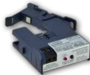
2350VFD Autoset current sensor self-learns for positive proof of flow on both VFD and constant volume fans and pumps