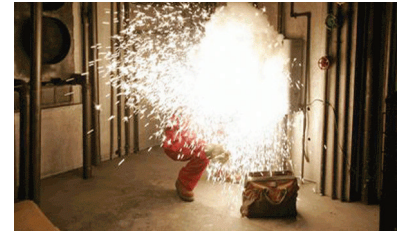
Click here to see 480V arc flash demo

Working with current sensors that require manual calibration in a live enclosure can put installing technicians in situations where they can be unnecessarily exposed to potential arc flash hazards.