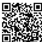
See Senva's Air Quality Products