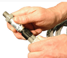
Cables are prefabricated and snap onto sensors with industrial deutsch connectors. This eliminates wire twisting when tightening sensors. IP65 rated for outdoor use when