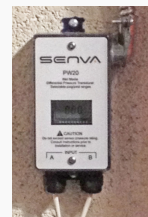
Pre-wired leads for fast snap connection to sensors